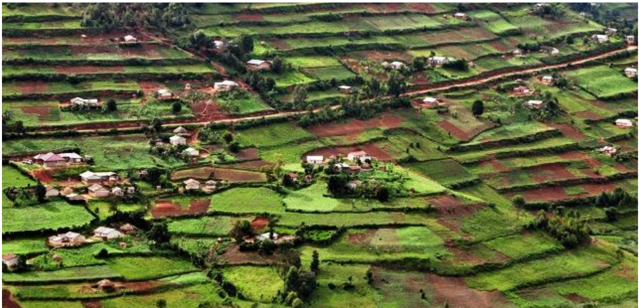
Lake Bunyonyi, in south western Uganda.

It is important for travelers to know that if one or more of those flights is not sufficiently booked, it will be cancelled without notice. Passengers are simply booked on the next Entebbe bound flight. However, adding a few more unexpected hours to your travels may not please you.