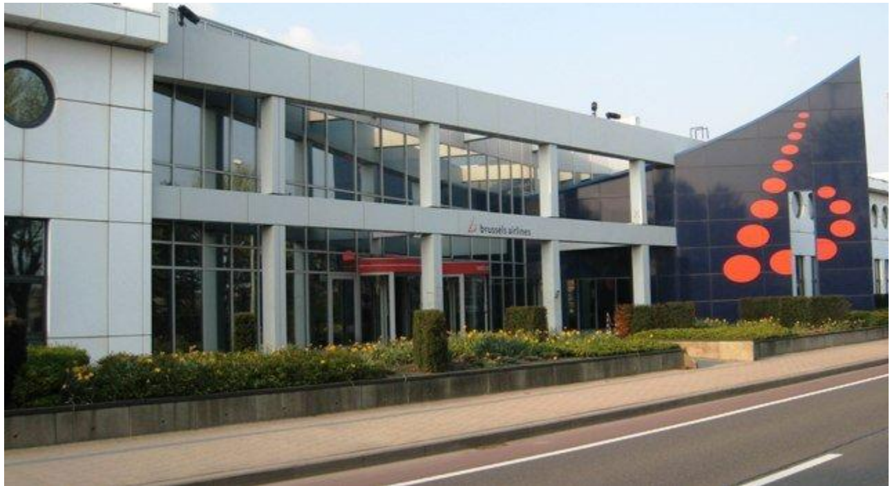
SN Brussels Airlines Headquarters, Brussels

Brussels Airlines is also part of Star Alliance.